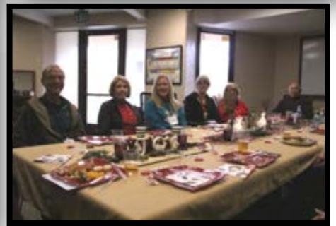
Members of the Bible Study group gather for their annual Christmas luncheon.

Submit photos from your church ministries and activities to bulletin@sjasr.org