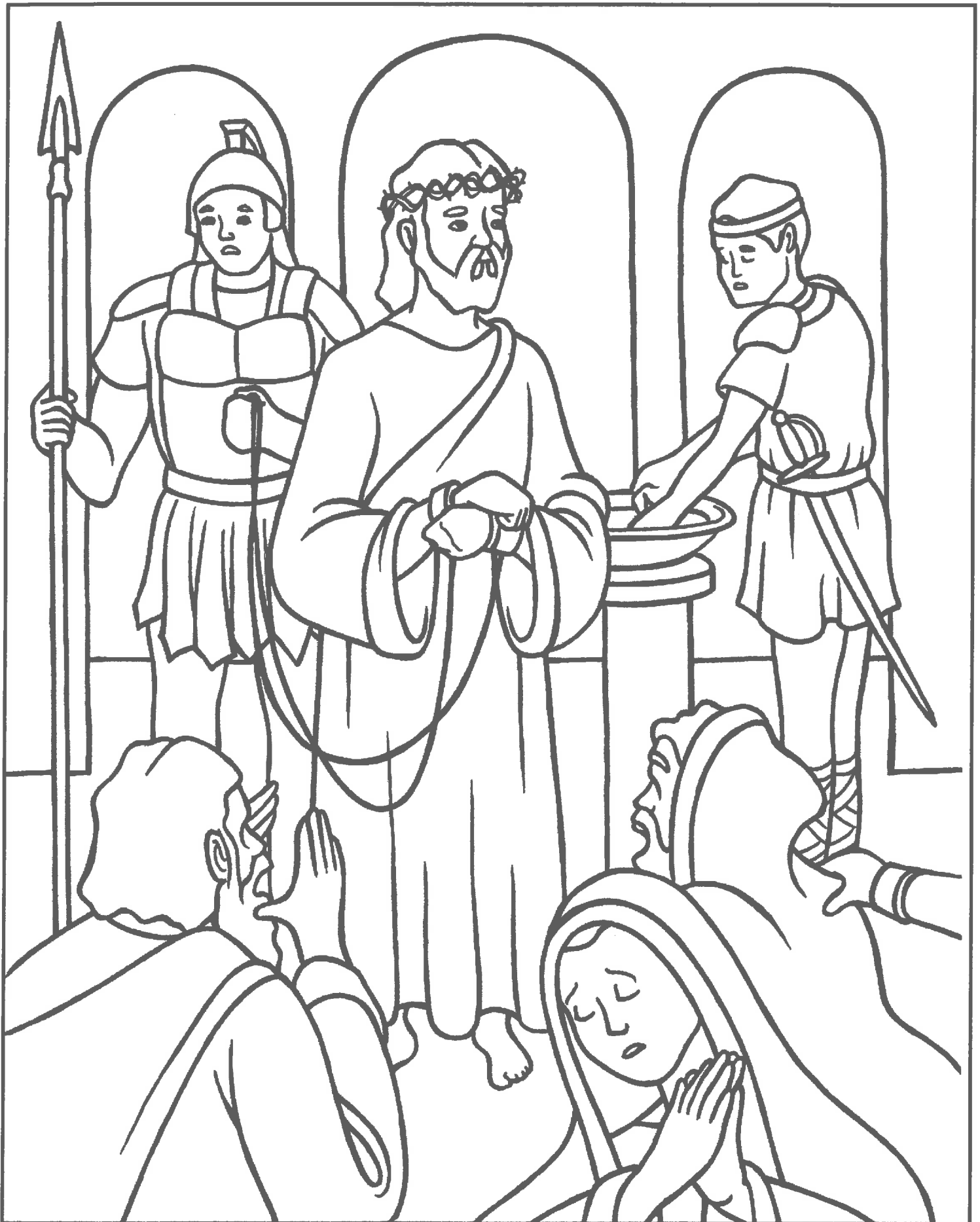
Station 1 - Jesus is condemned to death - © 2016 TheCatholicKid.com