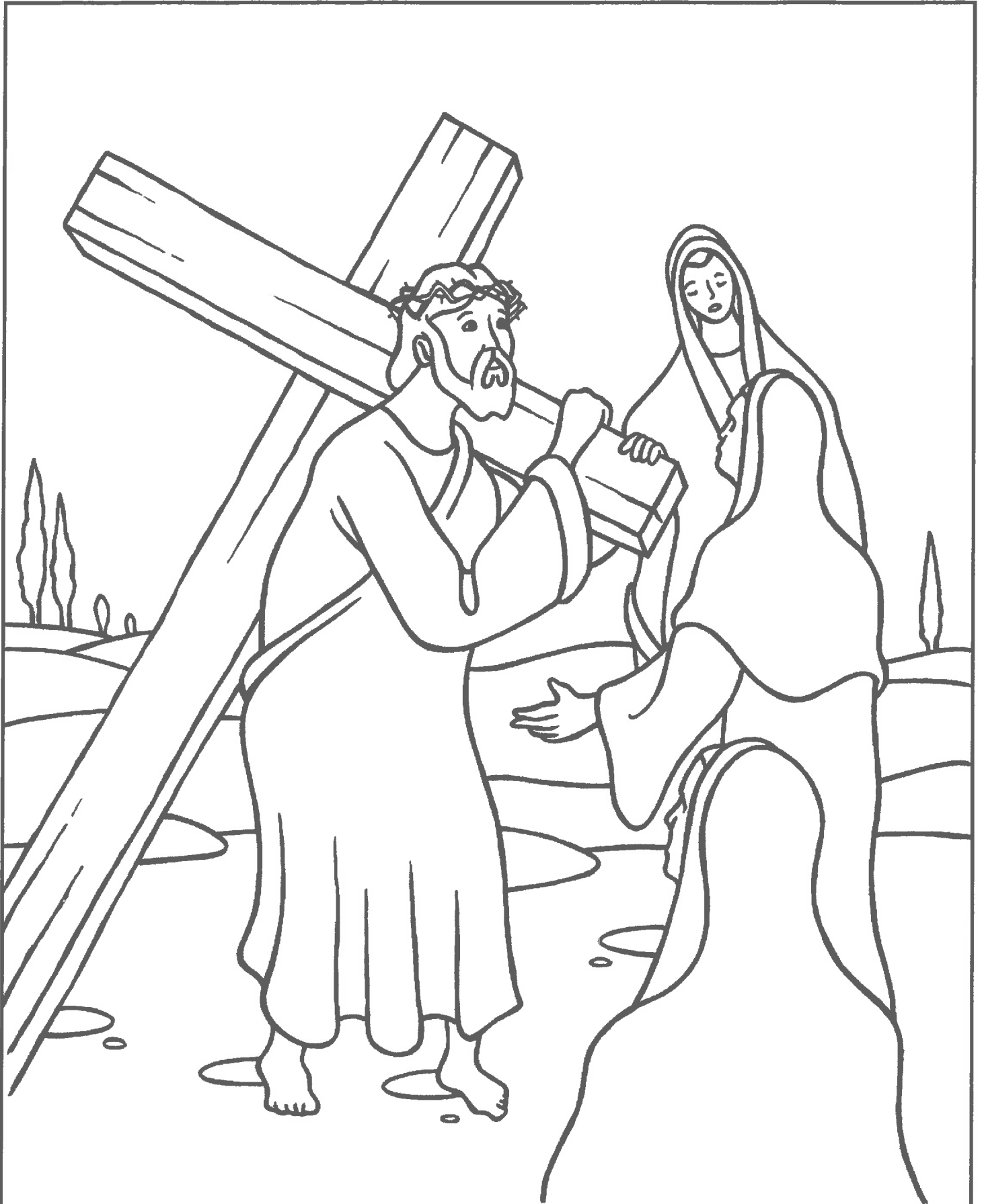
Station 8 - Jesus meets the women of Jerusalem - © 2016 TheCatholicKid.com